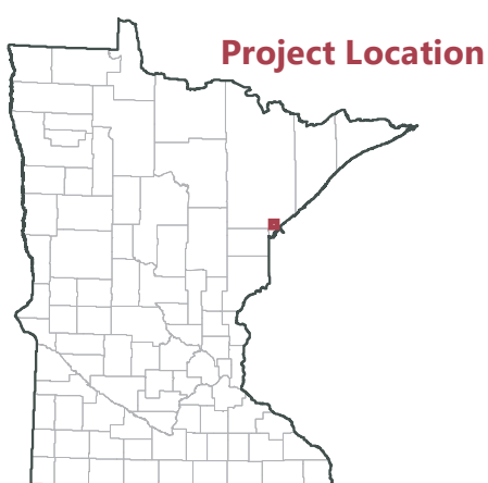
Figure 1 Project Location

Print Date: 7/27/2020 Printed By: zsvoboda, File: C:\Users\zsvoboda\Documents\05331007_Weiland\GIS\05331007_ProjLoc.mxd